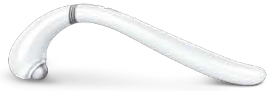
Ergonomic Massage Wand