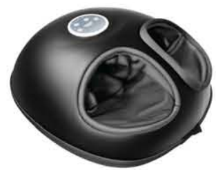
Air Pressure & Shiatsu Foot Massage